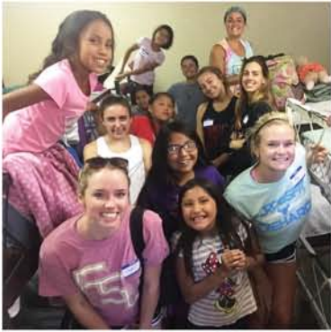
Eleven Apache children accepted Jesus and were baptized during a mission trip to Show Low, Arizona.