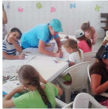
A team traveled to the Ukraine to teach children about the love of Jesus.