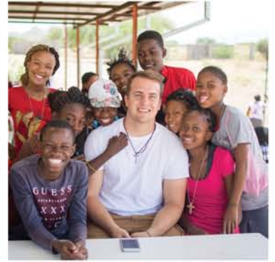
A Tomoka team led a week of summer camp, where they ministered to 50+ teens in Namibia.