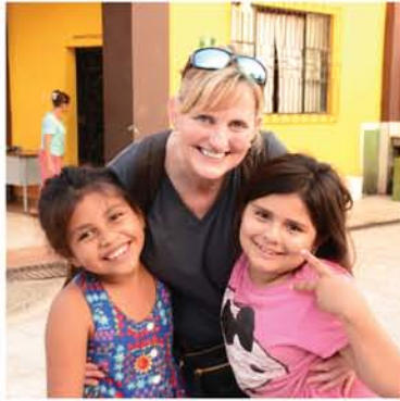
Eight people from Tomoka shared the hope of Jesus with orphans during a trip to El Salvador.